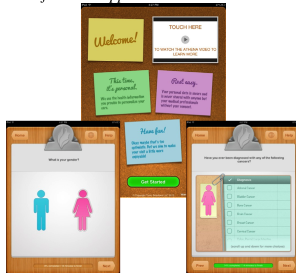
Figure 1. Sample Screenshots of Athena App

The mHealth tool used for the interviews was a breast health questionnaire app designed by the Athena Breast Health Network, a collaboration of the five University of California medical centers. The Athena Breast Health Network aims to assess the risk of breast cancer among women receiving mammograms across California with the Athena Breast Health Questionnaire administered either through an internet based survey prior to appointments or with an iPad app at the mammogram visit. The app presents one question on the screen at a time and captures data on personal health, demographics, lifestyle, family history, and breast cancer risk to incorporate several risk prediction models (Figure 1). The Athena app is currently available in English and Spanish with plans to expand to other languages.